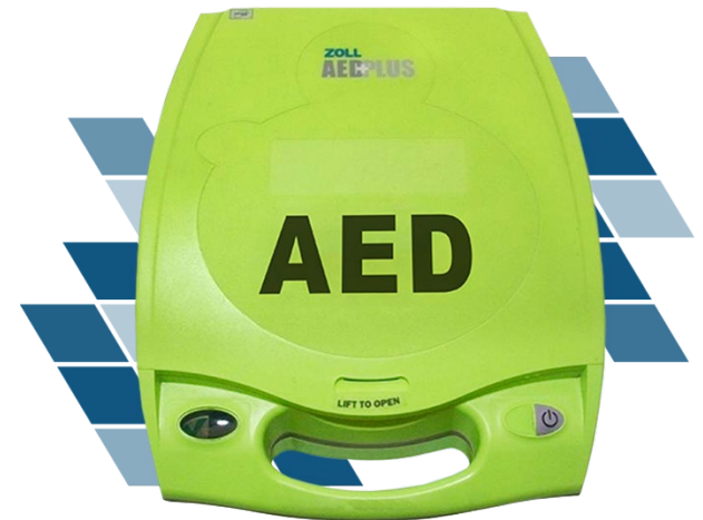
ZOLL AED PLUS